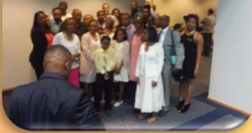
Praying over weddings in full array