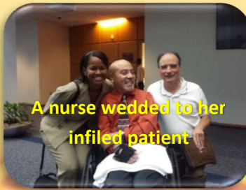
A nurse wedded to her infirmed patient