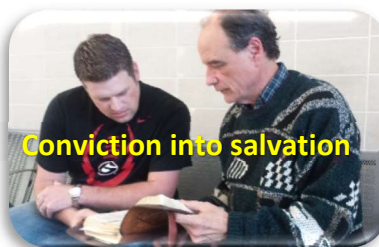
Conviction into salvation