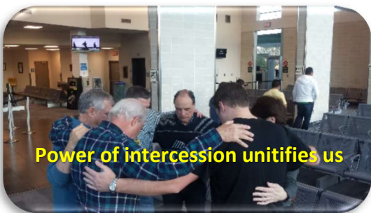
Power of intercession unifies us