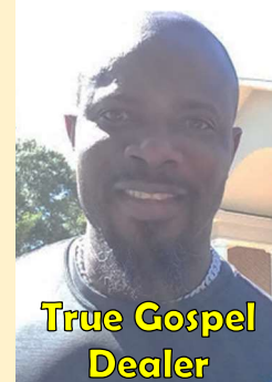
True Gospel Dealer