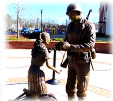
STATUTE OF COMPASSIONATE LOVE IN FRONT OF THE FORSYTH CO. COURTHOUSE

January 28, 2020 The first historical prayer walk around 7+ times at the Forsyth County Courthouse.