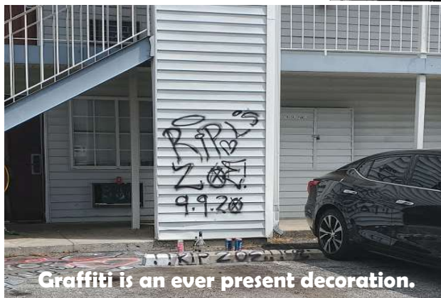
Graffiti is an ever present decoration.