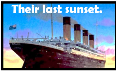
Their last sunset.