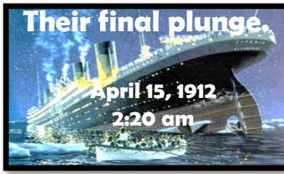
Their final plunge.

But Smith’s words were processed with a threat, “Not even God Himself could sink this ship.” That was the last straw at 2 am of any hope for the 882.9 ft. long, 92 ft. wide, 59 water ft. high, 46,328 tons, max. 40 mph’s with coal - 6000 tons, $7.5 million Titanic. ($1.8 billion today) The iceberg crushed six of the sixteen watertight compartments that brought the plunge 300 miles east of Newfoundland, Canada. All Board - first, middle, immigrant classes, and coal crewmen forever changed their destiny.