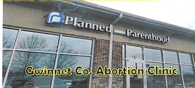
Gwinnett Co. Abortion Clinic