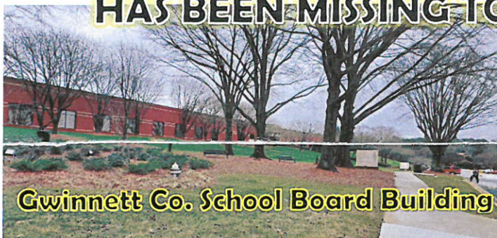
Gwinnett Co. School Board Building