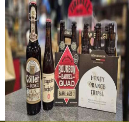
FOCUS ON SPIRITS