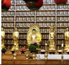
FOCUS ON SELF