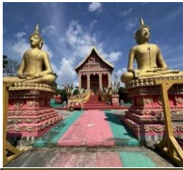
FOCUS ON SELF