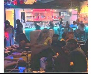
FOCUS ON PARTIES