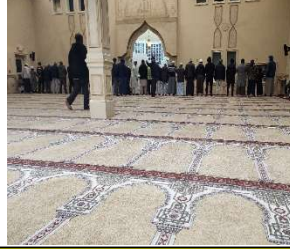
FOCUS ON ALLAH